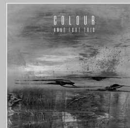
ANAT FORT TRIO/COLOUR SSC 1550 - IN STORES NOW

Jobim's legacy has lived on through his admirers, followers and apprentices. Bossa Nova and the Brazilian jazz tradition continue to flourish, led by the likes of drummer Duduka Da Fonseca and pianist Helio Alves. With the addition of the great vocalist Maucha Adnet, the friends have assembled a program of music highlighting the beauty of the Brazilian Jazz music that they have performed all over the world. Their new recording, Samba Jazz & Tom Jobim , was recorded to spread their passion even further.